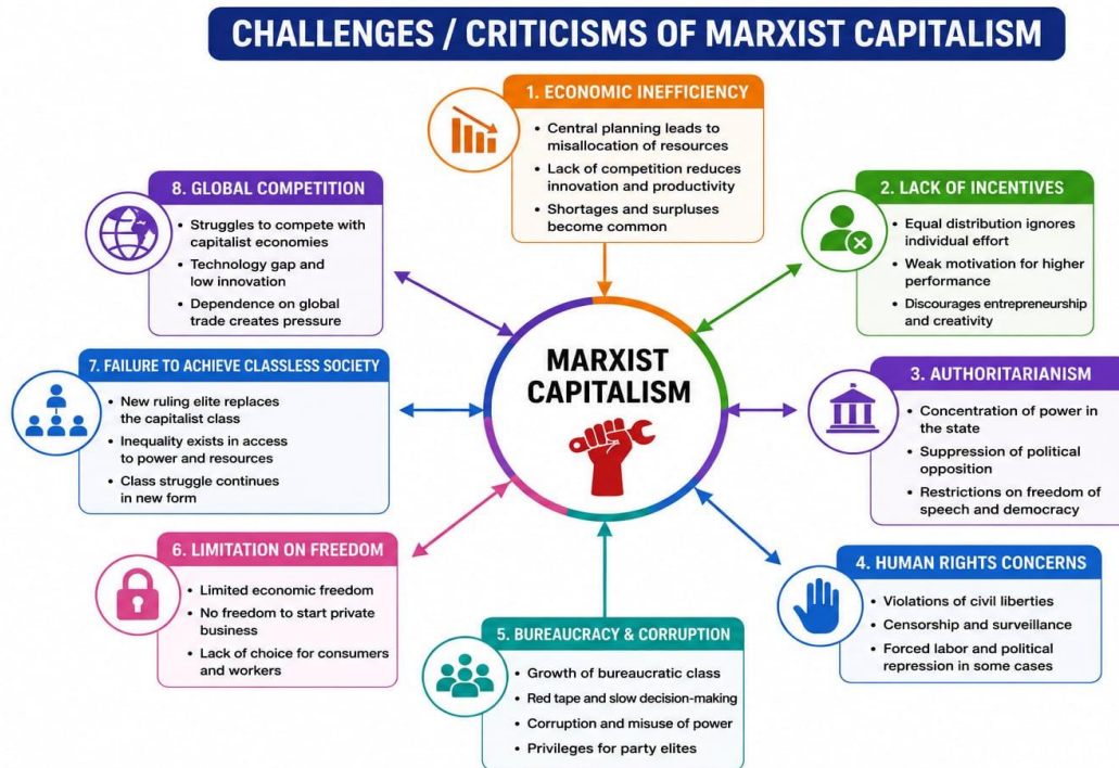
Figure: 3 challenges of Marxism capitalism